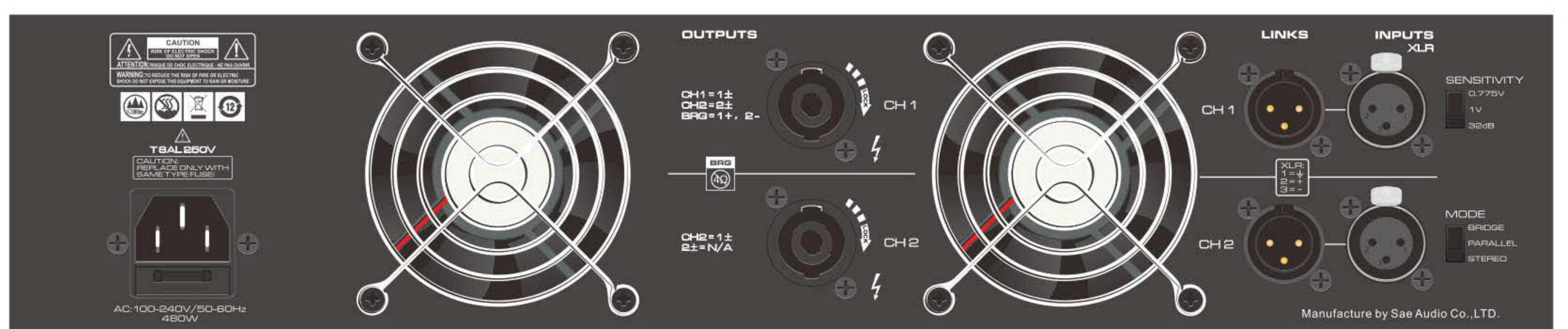
TX800 rear panel