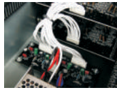
电源板连接线优化 Improved wire connection in PSB